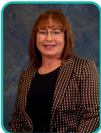
Deputy Mayor Michelle Smibert