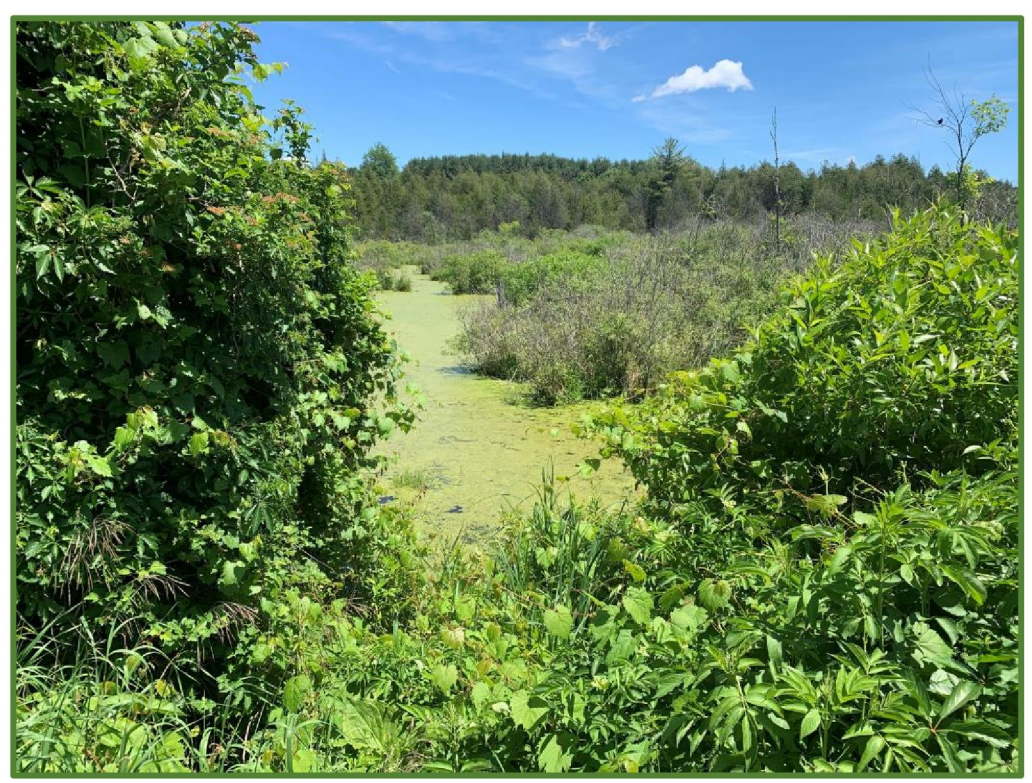
Photo 11: Assessed by Pedestrian Survey at 5m Intervals Facing South