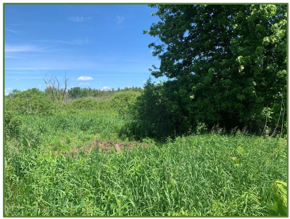
Photo 12: Assessed by Test Pit Survey at 5m Intervals Facing North