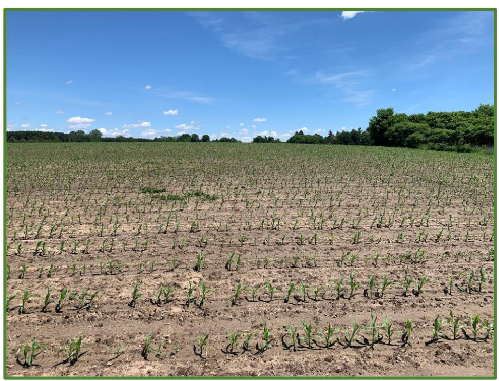
Photo 3: Assessed by Pedestrian Survey at 5m Intervals Facing West