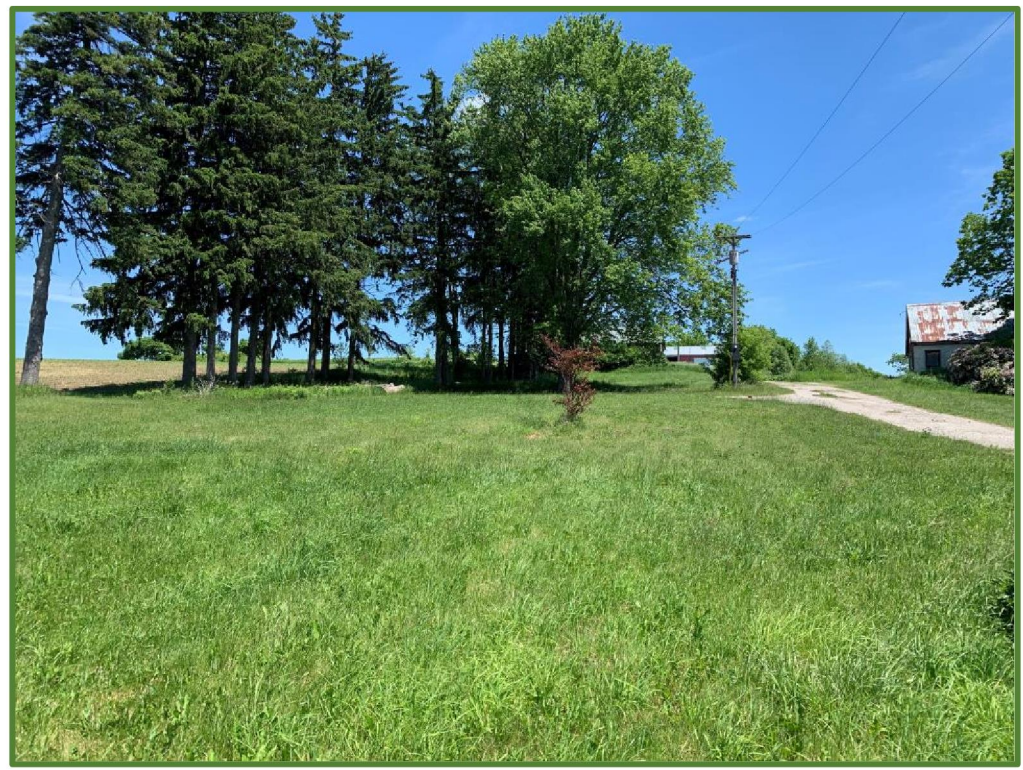
Photo10: Grass Assessed by Test Pit Survey at 5m Intervals East