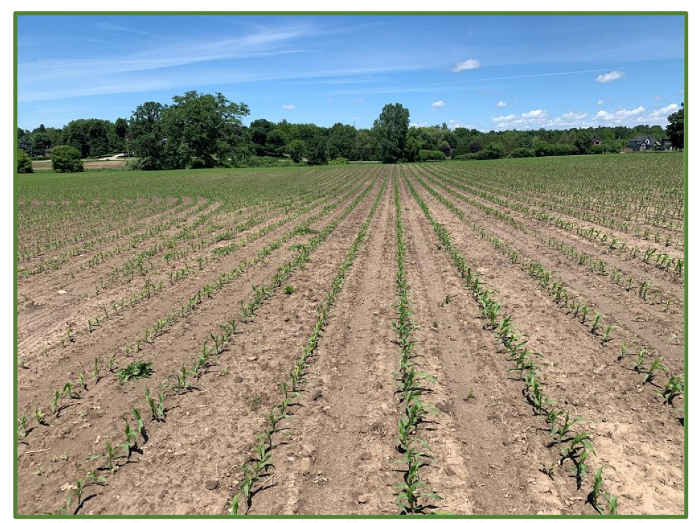
Photo 1: Assessed by Pedestrian Survey at 5m Intervals Facing North