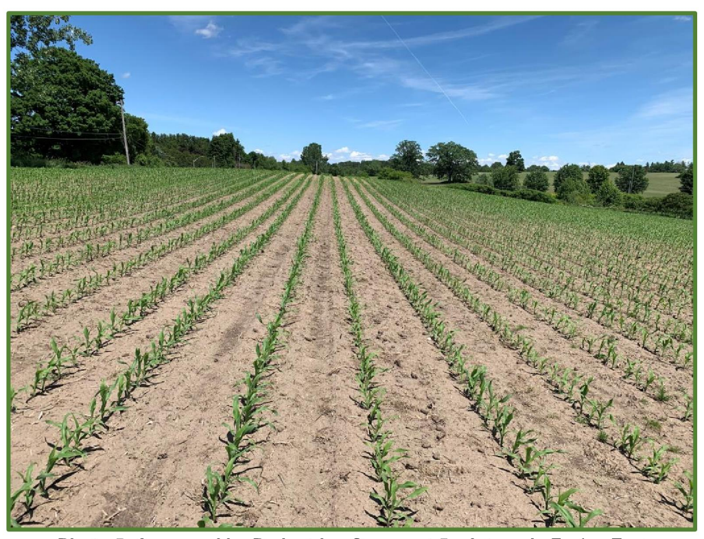
Photo 5: Assessed by Pedestrian Survey at 5m Intervals Facing East