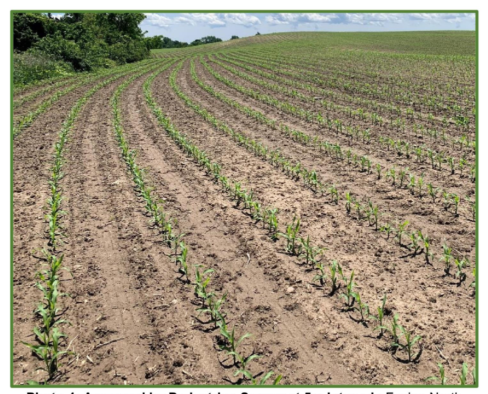
Photo 4: Assessed by Pedestrian Survey at 5m Intervals Facing North