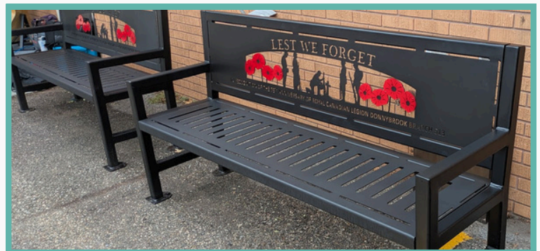
The Mayor Notified Council of Commemorative Benches Which Were Created to Recognize the 75 th Anniversary of the Donnybrook Legion.